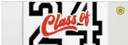
Class of 2024