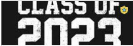
Class of 2023