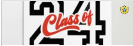
Class of 2024