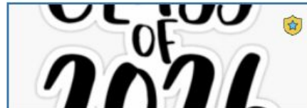
Class of 2026