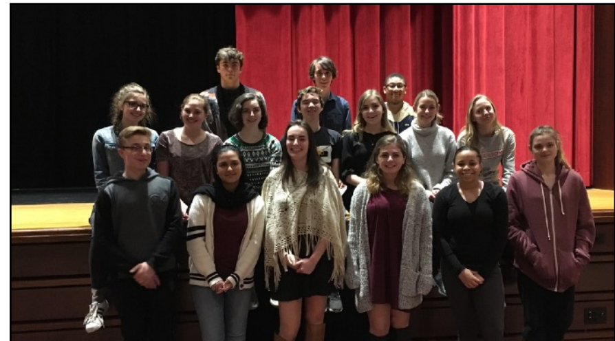
Theater Arts Field Trip to Byham Theater